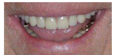
Restores smile and function