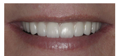
Builds back smile