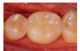
Silver fillings replaced by porcelain inlays/onlays