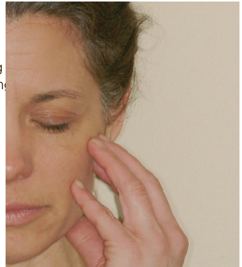
Facial, muscle or joint pain

Ignoring a jaw joint problem may lead to chronic, debilitating pain and an inability to function normally when chewing and speaking.