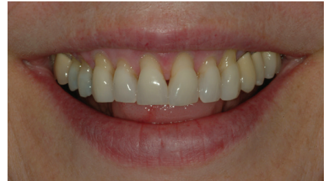
Perio involved recession

Most often a loose tooth will become progressively looser and eventually fall out. This process is frequently accompanied by pain and infection.