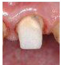
Broken down tooth built up with metal post and composite core