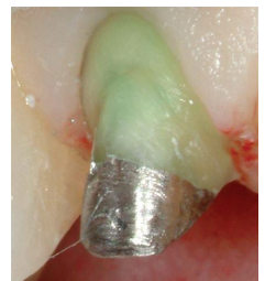
Broken down tooth built up with metal post and core