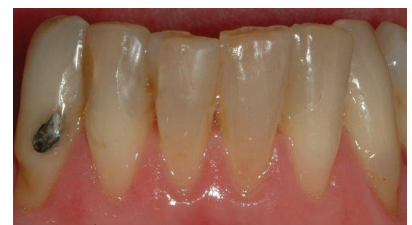
Examples of silver fillings