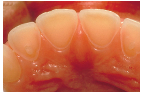
Erosion from Bulimia