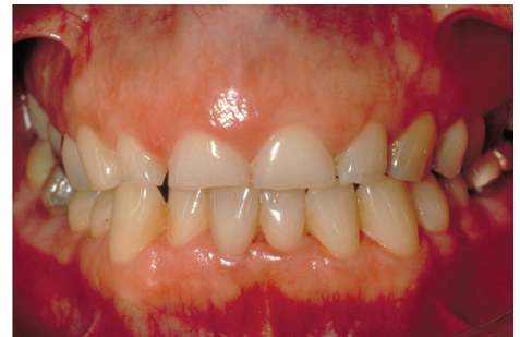
Wear from grinding